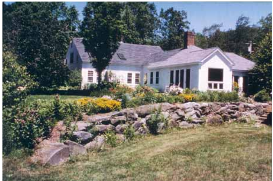
5. Fieldstone wall embraces the edge of the meadow. Views from the dining room addition sweep from the colorful foreground of native perennials southward across the meadow to the woodland edge.