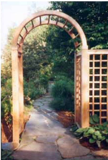
4. Gates, implied and literal, frame the entrances to garden paths beyond.