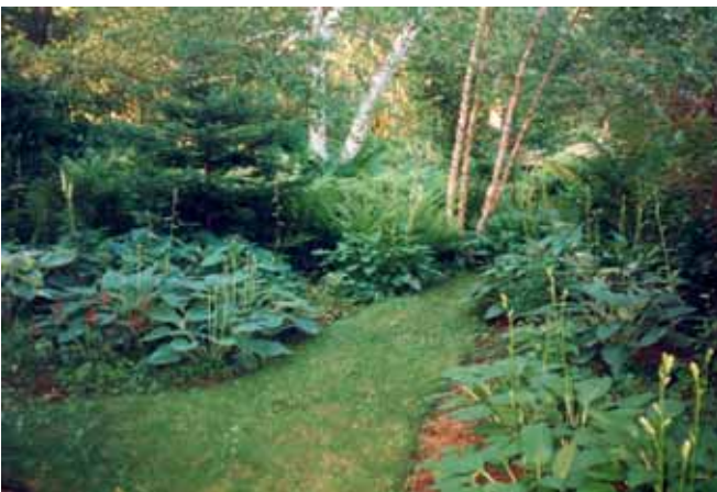
1. The narrow front yard is transformed into an inviting shade garden, with grassy paths meandering through to a gazebo and meadow view beyond.