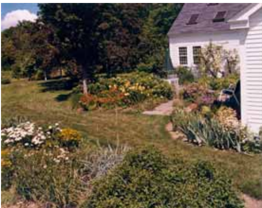
6. Gardens step into the sunny patio. Prime south-facing nook extends dining room to a sheltered corner with outstanding views.