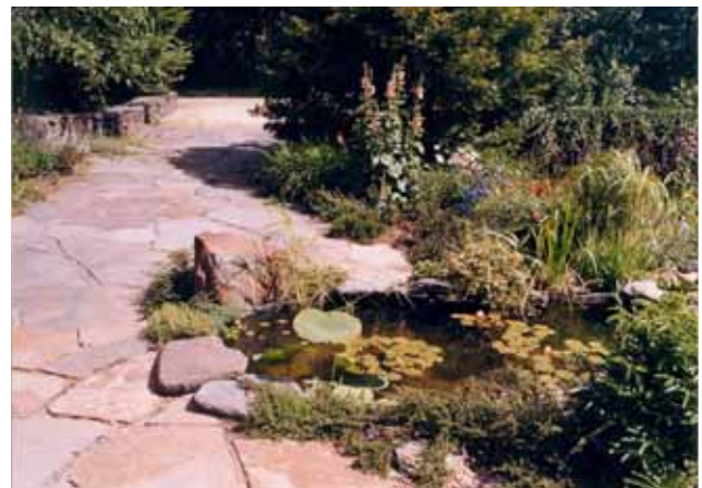
2. A low wall separates the stone entry court from roadside parking, but can support a car when needed for deliveries.